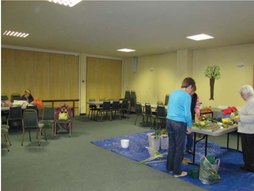
Polling Station 1 – GL1 split station Dimensions: 7.5m x 10m